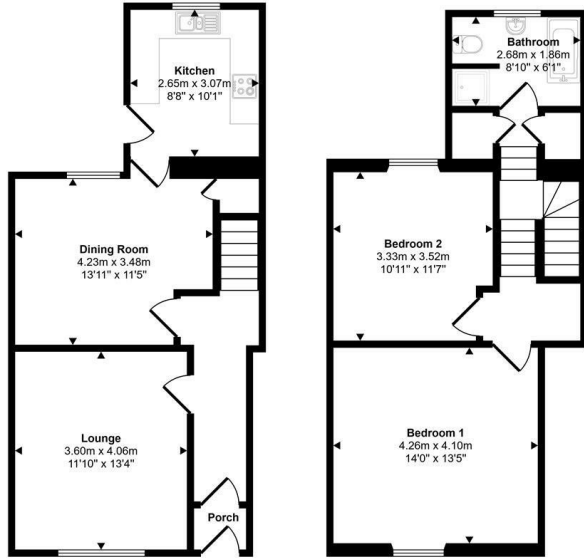
Ground Floor Approx 48 sq m / 514 sq ft