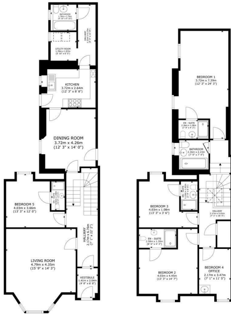
59, Dunkeld Road Perth, PH1 5RP FLOOR 1 93.6 m 2 (1,008 sq.ft.) FLOOR 2 86.5 m 2 (931 sq.ft.) TOTAL: 180.1 m 2 (1,939 sq.ft.) SIZES AND DIMENSIONS ARE APPROXIMATE, ACTUAL MAY VARY.