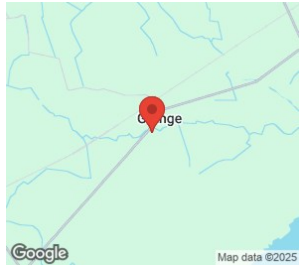
3 Bridgend of Carse, Grange, Errol PH2 7TB

GROSS INTERNAL AREA TOTAL: 738 sq.ft, 68.6 m 2