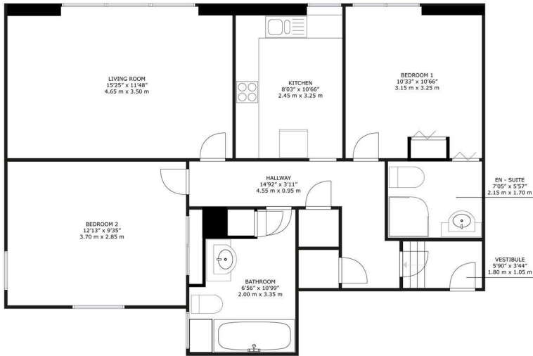
2 Princes Street Mews, Perth PH2 8LP

GROSS INTERNAL AREA TOTAL: 675 sq.ft, 62.8 m 2 SIZES AND DIMENSIONS ARE APPROXIMATE, ACTUAL MAY VARY.